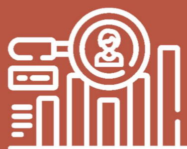
WOMEN ECONOMIC EMPOWERMENT